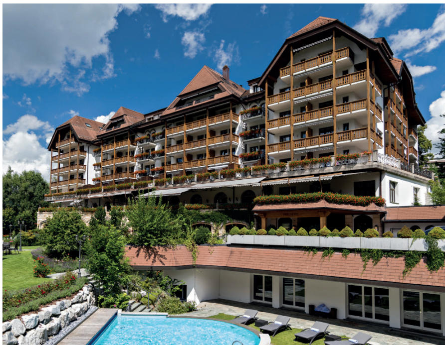
Park Hotel Gstaad