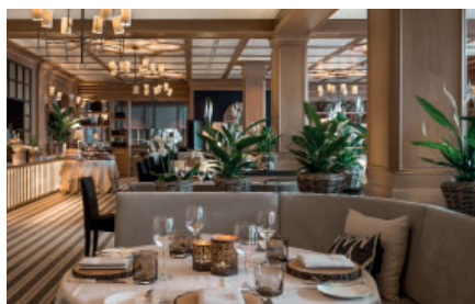
Park Hotel Gstaad, restaurant

Gourmet restaurant, Bar with food service, Lunch service in garden (summer), Chalet Waldhuus speciality restaurant (winter), Chubut firewood restaurant (winter), Garden, Outdoor pool, Indoor heated saltwater pool, Fitness room, Sauna, Spa treatments, Room service, Bike lounge, Children's playroom, Underground parking, Ice-rink in grounds in the winter, Golf simulator.