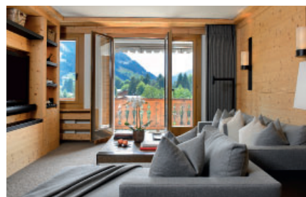
Park Hotel Gstaad, south facing room