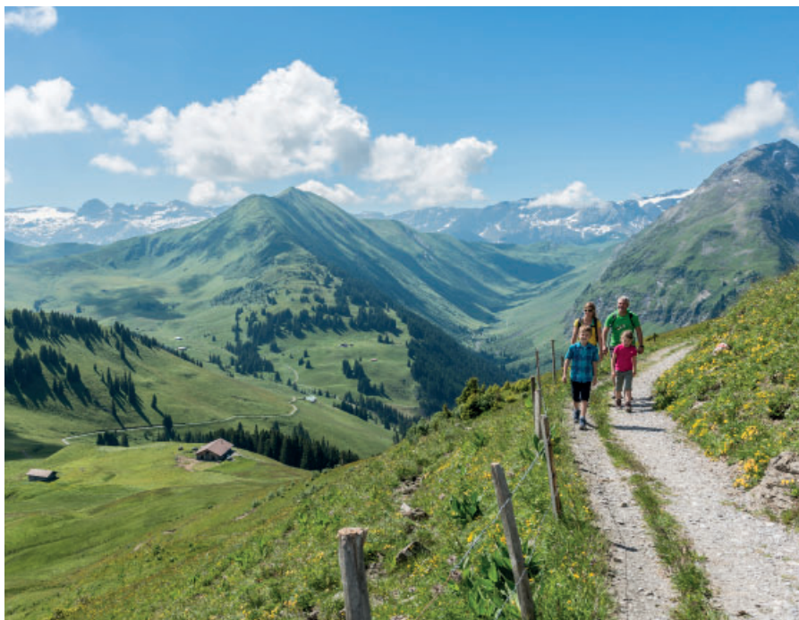
Saanenland near Gstaad

This seven-night self-guided walking holiday invites you to explore one of the most beautiful regions of Switzerland. A popular ski resort in winter months, summertime transforms the Saanenland into a walker's paradise. Charming chalet villages are enclosed in verdant alpine meadows where the gentle chiming of cattle bells drifts on the breeze. The surrounding mountains such as the Wispile, Hornberg and Rinderberg are gained by cable car, allowing easy access for stunning hikes along the lofty ridges. This summertime walking holiday for individuals includes itineraries which explore the majestic mountains, wide valleys, sparkling lakes and dense forests before returning to your luxury hotel in the stylish yet traditional alpine village of Gstaad.